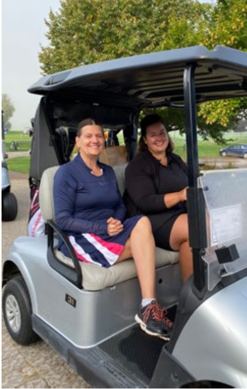
Photos from the Erb Group's 31 st Annual Charity Golf Tournament.

We are thrilled to have contributed more than half a million dollars to charities that make a difference in the Wilmot region. These donations were shared among three charities: The Wilmot Family Resource Centre, Interfaith Counselling Centre, and Aldaview Services.