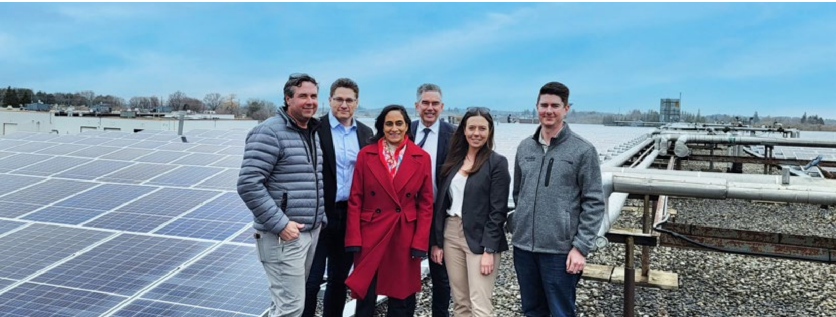
Former Minister of Defence visiting sunroof pannels at our Baden location — 2023.